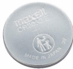
Coin type lithium manganese dioxide battery CR2032S